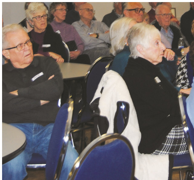
Members and Guests listening to the mayor covering the complexities of Newmarket