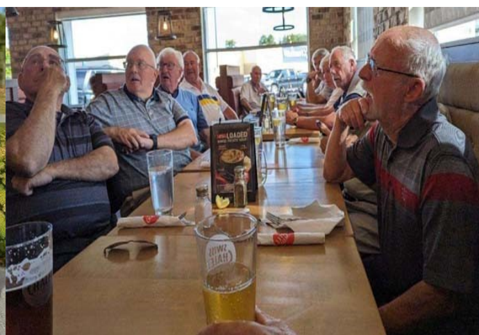
GOLF SCORES SEEM TO SHRINK AFTER