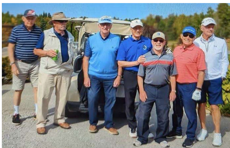
THE NEWMARKET TEAM